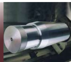
CUSTOM MACHINING & FABRICATION