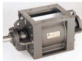
PMV® MODULAR ROTARY VALVES

We've been designing and manufacturing smarter products of unmatched value for over 30 years. Our innovative engineering department and skilled craftspeople work with customers to create unique solutions that give them a competitive edge by increasing throughput, improving efficiency, and maximizing uptime. Are you pushing productivity? We can help. Call us.