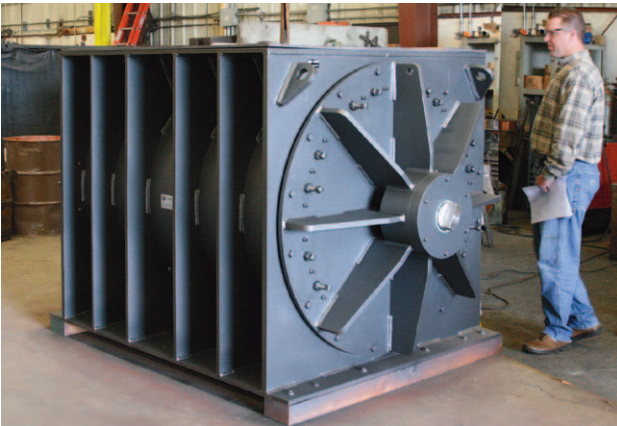
Figure 1. Precision's PM-48 rotary feeder. A large manufactured and machined rotary feeder used to handle raw materials in cement plant operations.

After the raw material is removed from the quarry and goes through the hammer mill, the first piece of equipment that takes the harshest beating during plant operation is the rotary feeder. Cement plants are engineered and constructed differently; however, their end product is basically the same. Rotary feeders, as seen in Figure 1, are typically used to meter raw